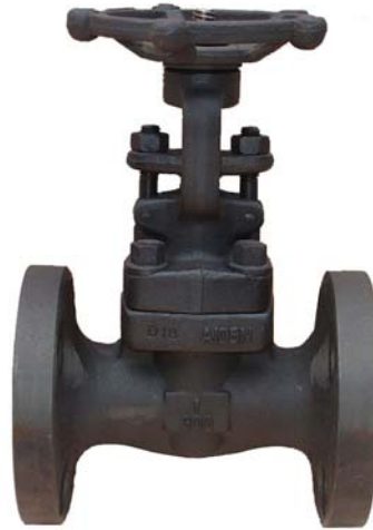
FIG. CF 150 GATE VALVE