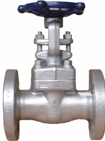
FIG. GF 1500 GLOBE VALVE

BS 5352, ASME B16.34 Connections according to: ASME B16.5 ASME B16.25